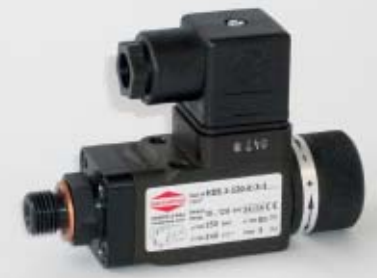
HK HDS 1 120 K31